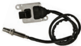
66-001P - Downstream GM (2014-10) VIO 290K+