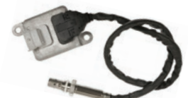
66-008P - Upstream Ram Trucks (2012-11) VIO 130K+