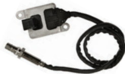
66-002P - Upstream GM (2014-10) VIO 290K+