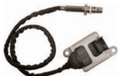
66-009P - Downstream Ram (2012-11) VIO 130K+