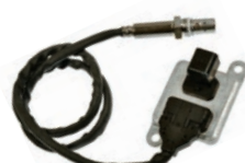
66-010P - Downstream GM (2016) VIO 130K+