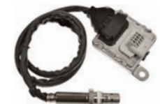
66-012P Ford (2019-17) VIO 550K+