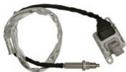
66-005P - Upstream Ram Trucks w/ 6 Cyl. 6.7L Engines (2018-13) VIO 710K+