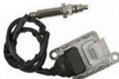
66-006P - SCR Catalyst Outlet Ram Trucks w/ 6 Cyl. 6.7L Engines (2017-14) VIO 410K+