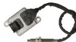
66-007P - Turbo Outlet Pipe Ram Trucks (2015-13) VIO 220K+