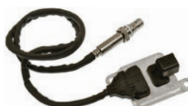
66-011P - Upstream Ram (2018-13) VIO 140K+