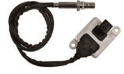
66-004P - Upstream GM (2015) VIO 180K+