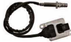
66-003P - Downstream GM (2015) VIO 180K+